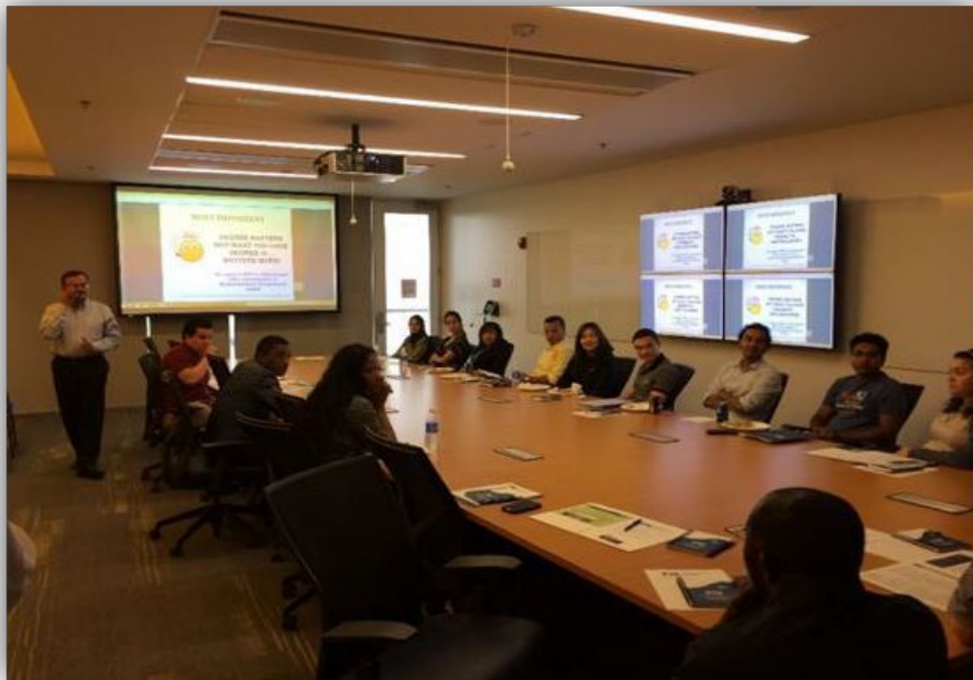
(Above.) Q&A session for EHS students and prospective students.

EHSA Website: https://fiu.campuslabs.com/engage/organization/environmental-health-graduate-student-association